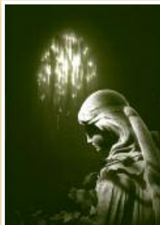
We are the Lost Ones