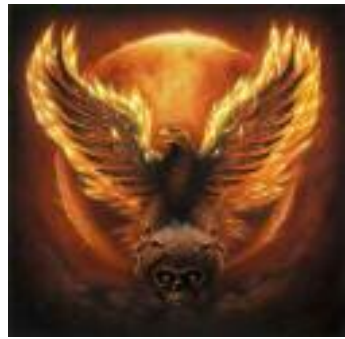
Fated to Burn