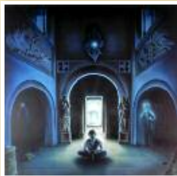
A Mended Rhyme