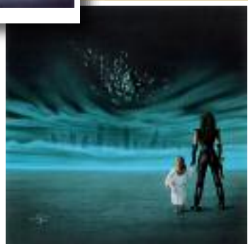
A New Bread of Rebellion