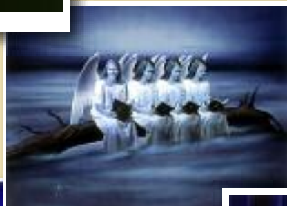
Lies in Black