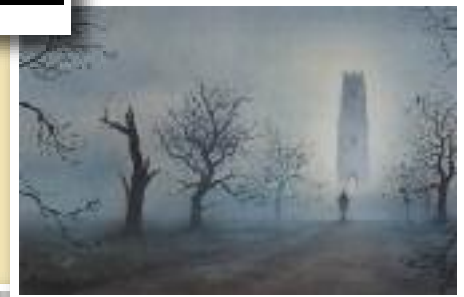
The Bad Lands