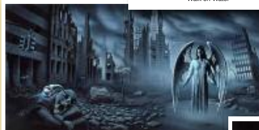
Patents of Control