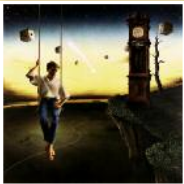
21st Century Dream