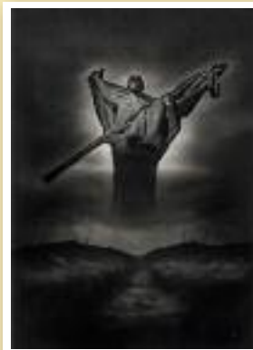
They Did Not Pass