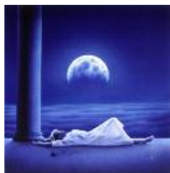
Age of Innocence