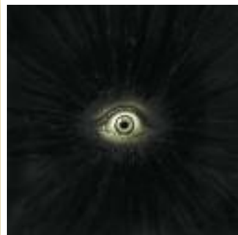
The Eye of the Abyss