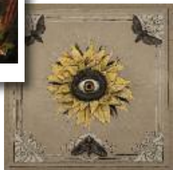
Between the Madness