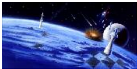
Beyond the Stars