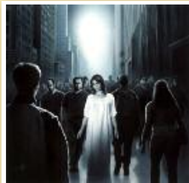
A Great Divide