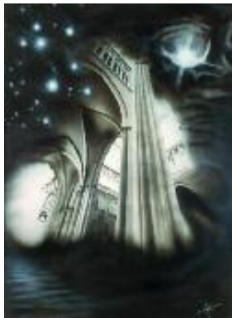
Some Kind of Heaven