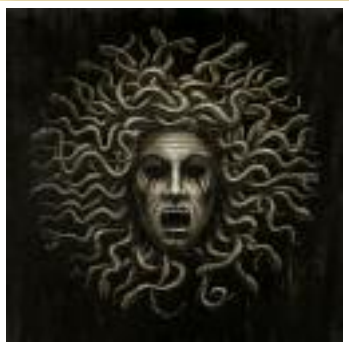
The Desecrated Mother of Chaos