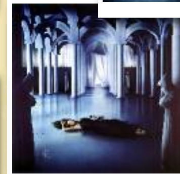
Requiem for the Innocent

Original art of Rainer Kalwitz available from Festival Art and Books