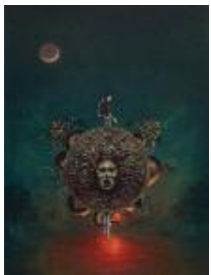
All Heads Turn