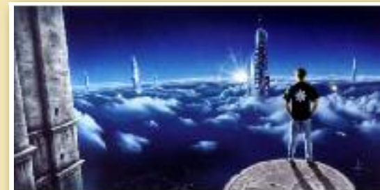
New Age Dawning