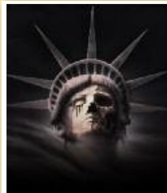
Miss Liberty Decayed