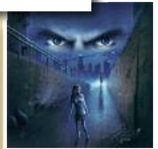
Fear the Night